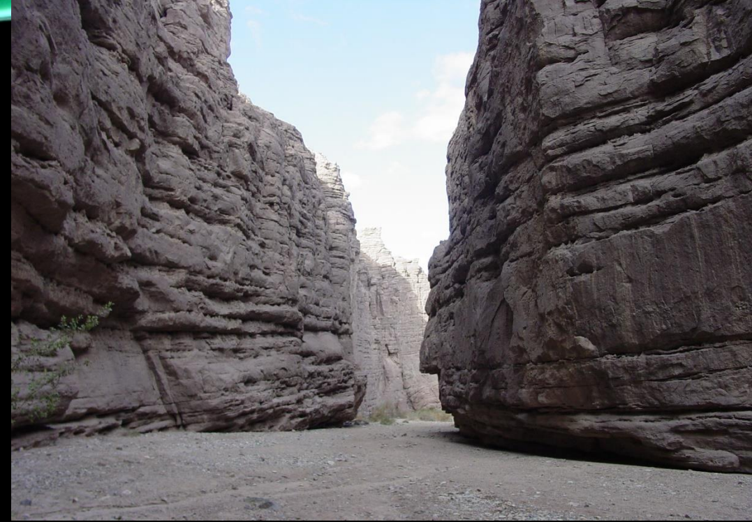
Valley of Shadows: Sandhan Valley, India